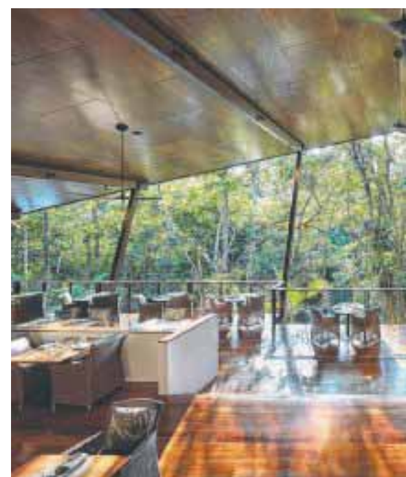
Top row, Longitude 131 at Uluru; the Fokker 70 Royal Jet; seats in the Royal Jet cabin; Mount Mulligan Lodge room; at Silky Oaks Lodge; Brahman cattle at Mount Mulligan Lodge

Day three of the tour arrives and with a spin of the colour wheel, we leave the ochre hues of Central Australia as our Royal Jet completes a special flyover of Uluru and Kata Tjuta and heads northeast to the lush greenery of Tropical North Queensland. An hour's drive north of Cairns, the newly refurbished Silky Oaks Lodge, also a Baillie Lodges property, sits at the edge of the Daintree Rainforest, its 40 treehouse-style retreats surrounded by dense tropical foliage. Perched